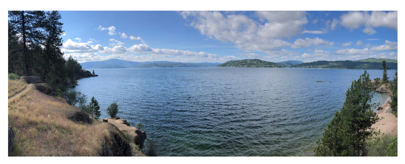
Visit us at www.tubbshill.org

Tubbs Hill, Inc. is a non-profit association dedicated to the preservation of Tubbs Hill City Park as a unique and natural lakeshore forest typical of North Idaho while providing for compatible public use. We act as advocates for the park; advise the city administration on issues pertaining to the park; and support volunteer efforts, fund raising, community relations, and other tasks as needed to achieve this goal.